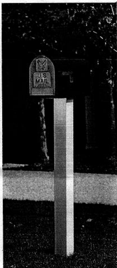
PP400W Top Mount Post (Mailbox not included.)